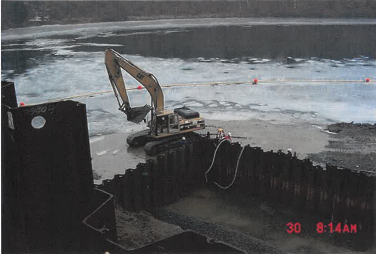
Example of a shoreline coffer cell and excavator on the mudflats.