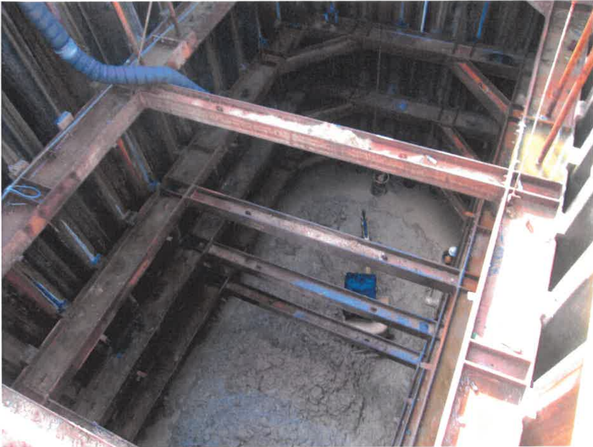
Example of a narrow sheet pile structure with struts to suit this type of work.