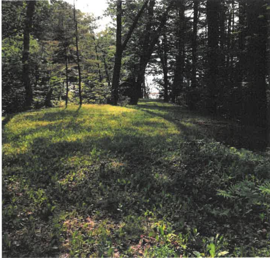
Upland route looking east over the "horseback" roadway zone at the Eckrote property