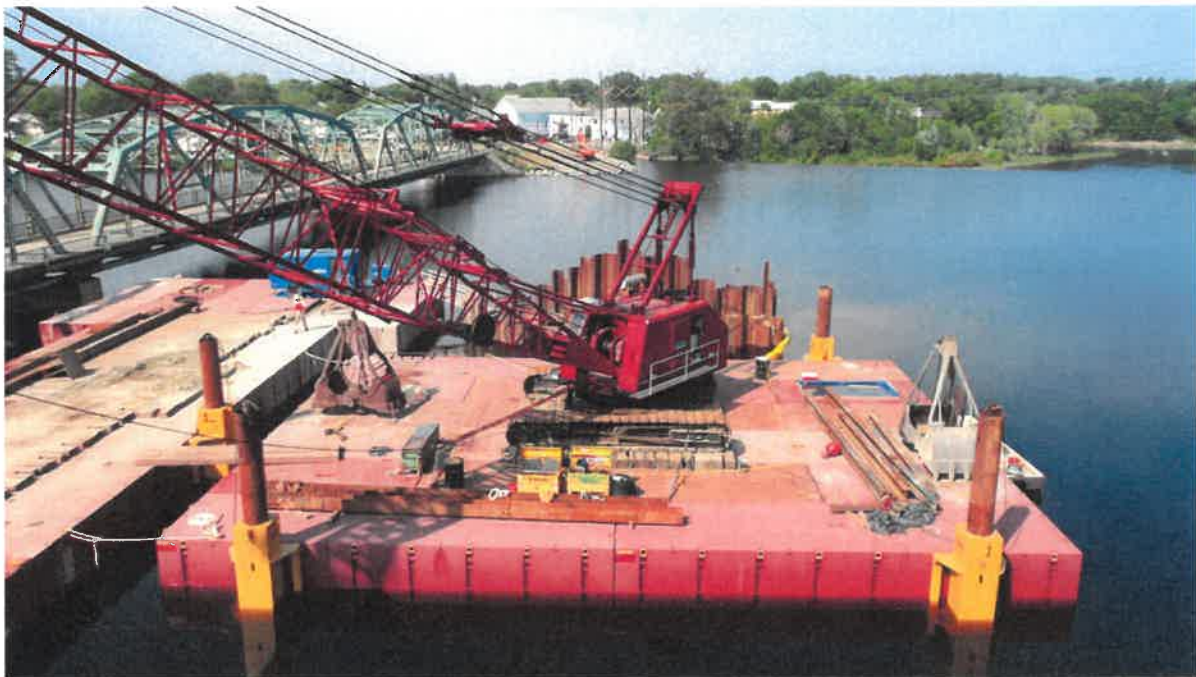
Example of a spud barge with crane, clamshell suited for this work.