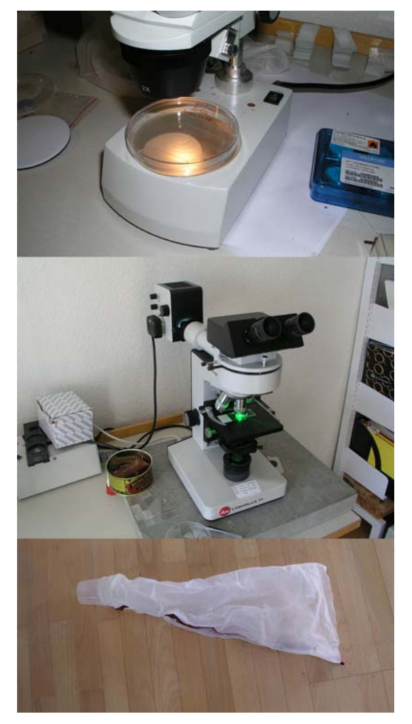
Figure 1. Microscopes and plankton net (80 \mu m ) used in the survey

B. A zooplankton net with mesh-size 450µm was dragged, just below the surface, behind a small motor boat making 1-2 knots for about 10 minutes. A speed log