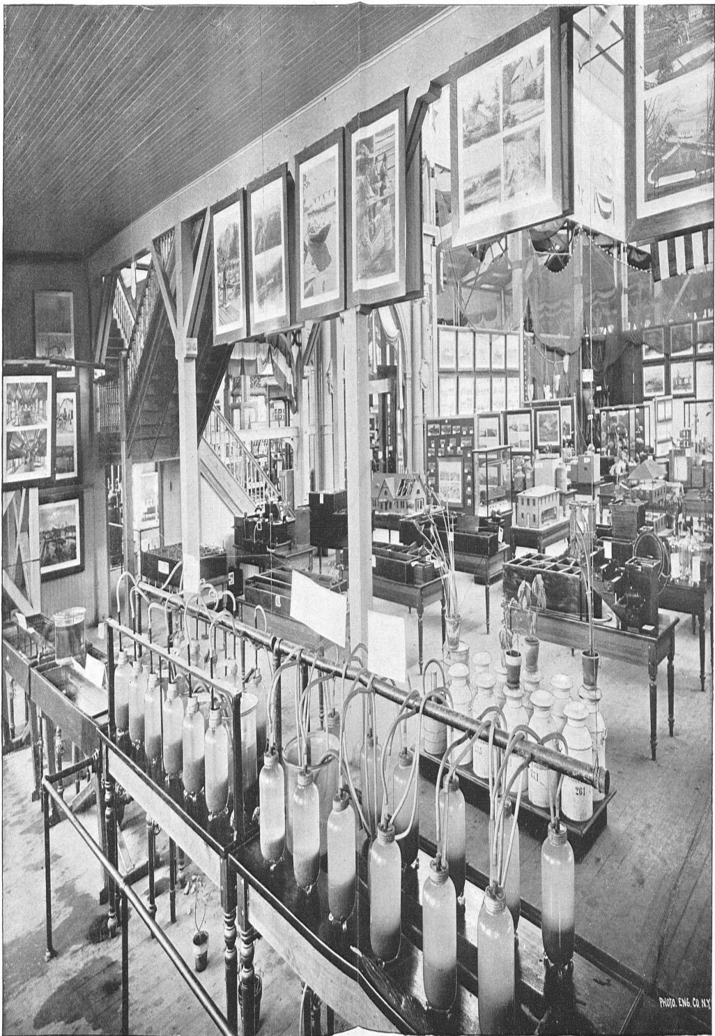
FISH-CULTURAL SECTION.—SHAD AND WHITEFISH HATCHING TABLES AND TROUT AND SALMON TROUGH S LOOKING FROM SOUTH ENTRANCE TO BUILDING, WITH OTHER FORMS OF FISH-CULTURAL APPARATUS IN THE BACKGROUND.