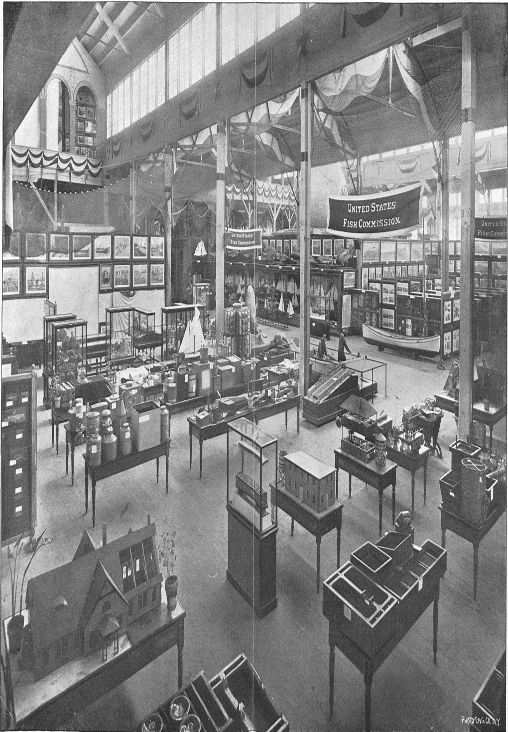
FISH-CULTURAL SECTION.—MODELS OF LEADVILLE, STATION, COLORADO, BATTERY STATION, MARYLAND, UNITED STATES FISH COMMISSION CAR NO. 1, BESIDES VARIOUS FORMS OF HATCHING, COLLECTING AND TRANSPORTATION APPARATUS, WITH 70-FOOT CASE CONTAINING VESSEL MODELS IN THE BACKGROUND.