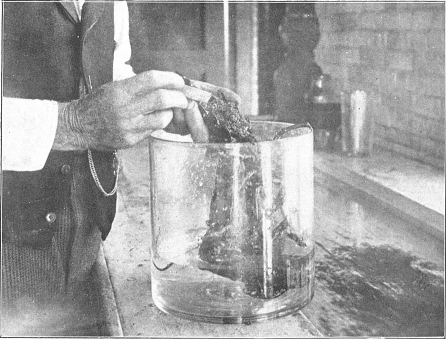
METHOD OF STRIPPING EGGS FROM A LOBSTER